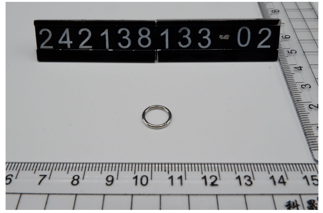
- END -